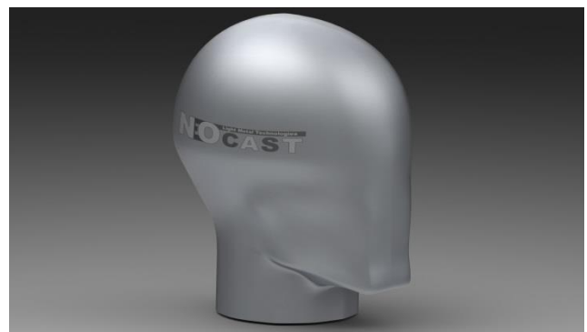
Fig. 1. Type 625 magnesium alloy headform that includes a base for attaching a 7265A-type sensor

We are proud to announce that NeoCast is now in a position to supply you with a set of magnesium alloy headforms (all standard sizes available, see Fig. 1, 3) that fully comply with all the requirements of the current EN 960:2006 standard in terms of shape, precision-balanced centre of gravity and high resonance frequency.