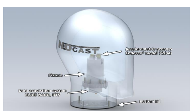
Fig. 3. Visualization of headform with components

Please do not hesitate to send us any questions you may have (contact details in the header). We also invite you to visit our website at http://neocast.pl where you can obtain further information about the scope of our business activities and our current range of products.